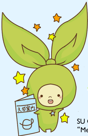
SU Official Mascot "Merin-chan"

We are looking forward to seeing you in Saitama!